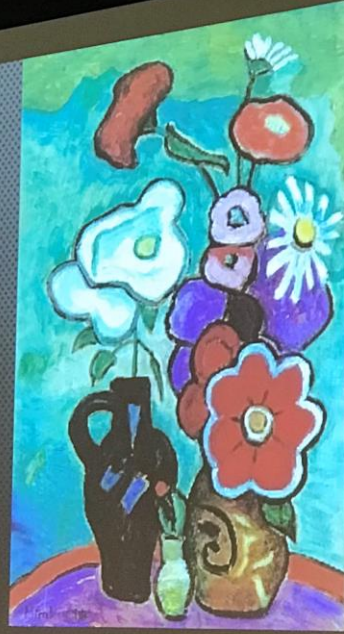
FLOWERS WITH WHITE ROSE (BLUMEN MIT WEISSER ROSE), 1958